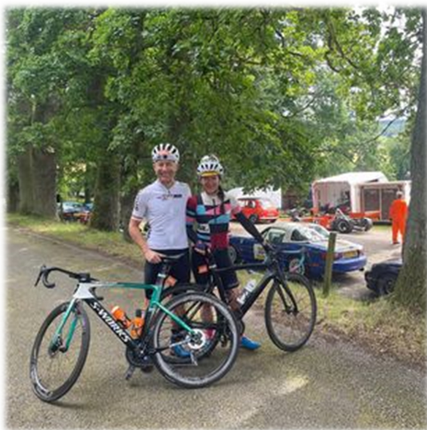
A German couple who had been competing in the cycling world championships in Glasgow happened on Fintray when doing a Scotland tour